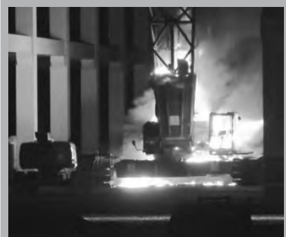
Incendiary sabotage of a crane on the building site of an Amazon logistics center, Achim, Germany, July 2020.

We include this text even though it is referring to Ring in a French context it is important for a UK context because of the increased use of the door cameras which are not subject to EU law anymore and could or are already being used in the same way as in the US.