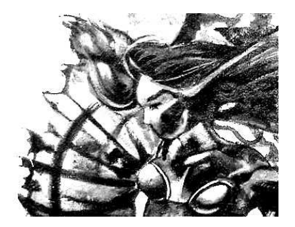
INTERNATIONAL NETWORK OF COUNTER-INFORMATION & TRANSLATION

Again and again, I am told what to think by the writers of this text. I am even told categorically that there is nothing beyond death! Well, I am no Christian nor any other colour of religious person, but I have had my experiences in life and I cannot say there is nothing beyond death because I simply do not know and am also prompted sometimes to wonder about whether the binary of 'life' and 'death' is simply a crude example of human ignorance. Anyway, what comes next is a question my imagination plays with frequently and always will. But whatever the subject and whether or not I disagree with their conclusion, I guess the real point is that I am sick of being told what is correct anarchist thought and what is not, sick of feeling like my legs are more shackled after the anarchists have spoken than before! And I wonder how we think there will ever be a way of spreading our ideas when the ideas become so cold and