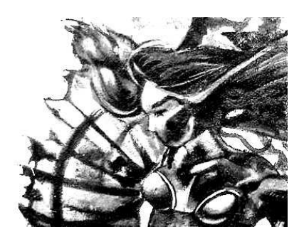
INTERNATIONAL NETWORK OF COUNTER-INFORMATION & TRANSLATION

UK- Squatters warm up a little this month after physical resistance to two squat evictions in Cardiff & Brixton, and an expolice station got squatted in Cardiff too..